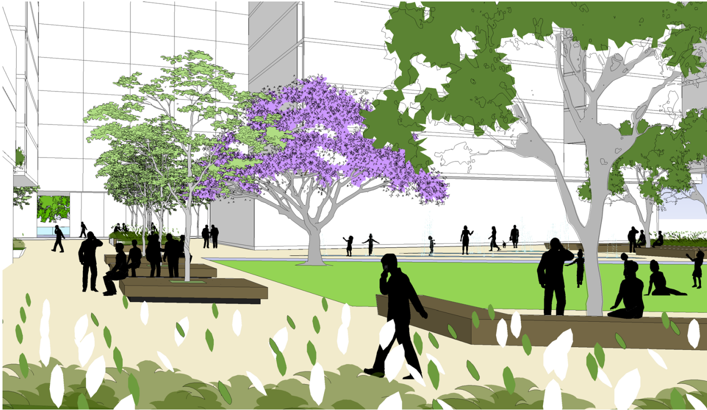
Park View 1