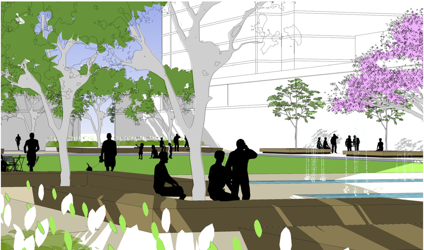
Park View 3