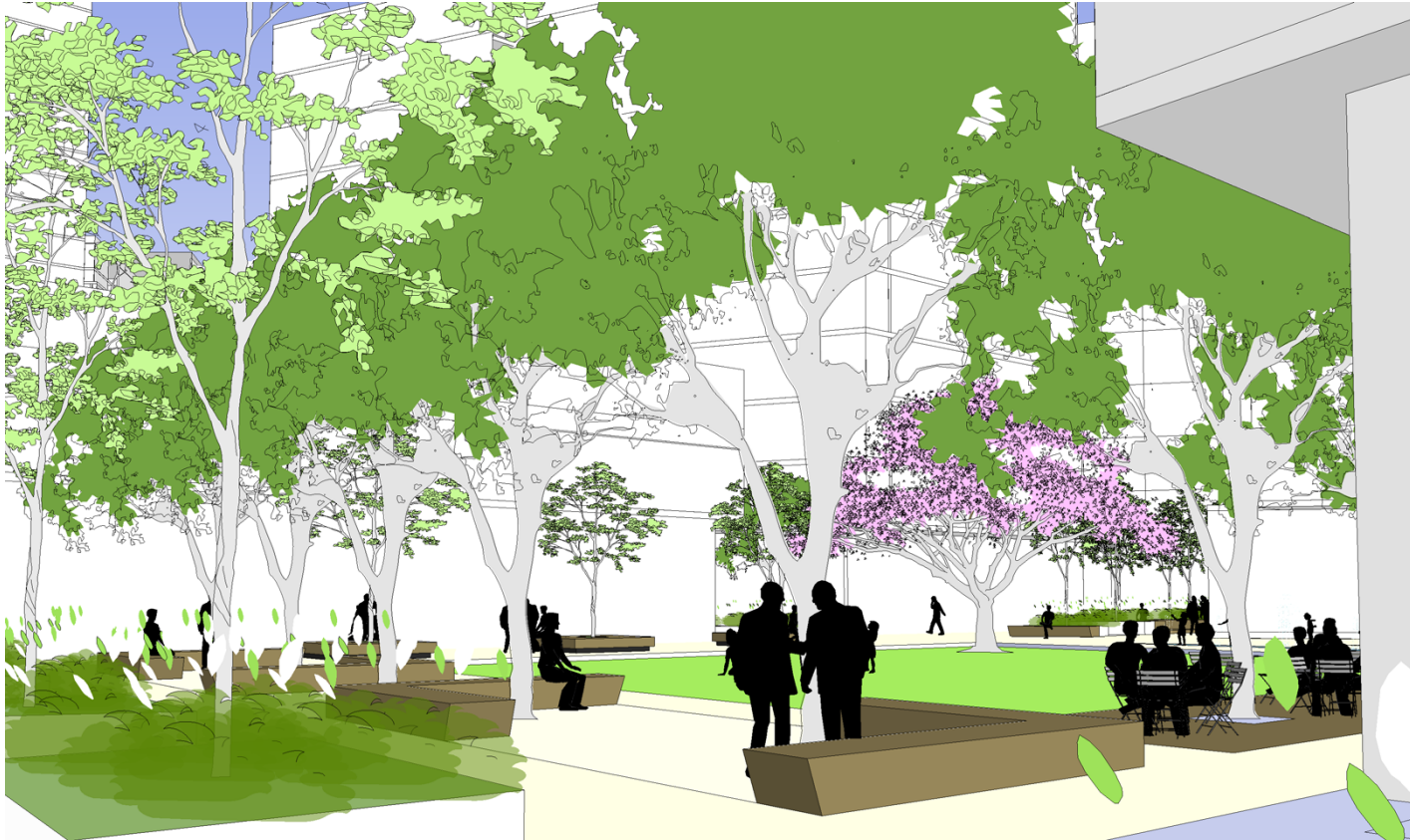
Park View 2